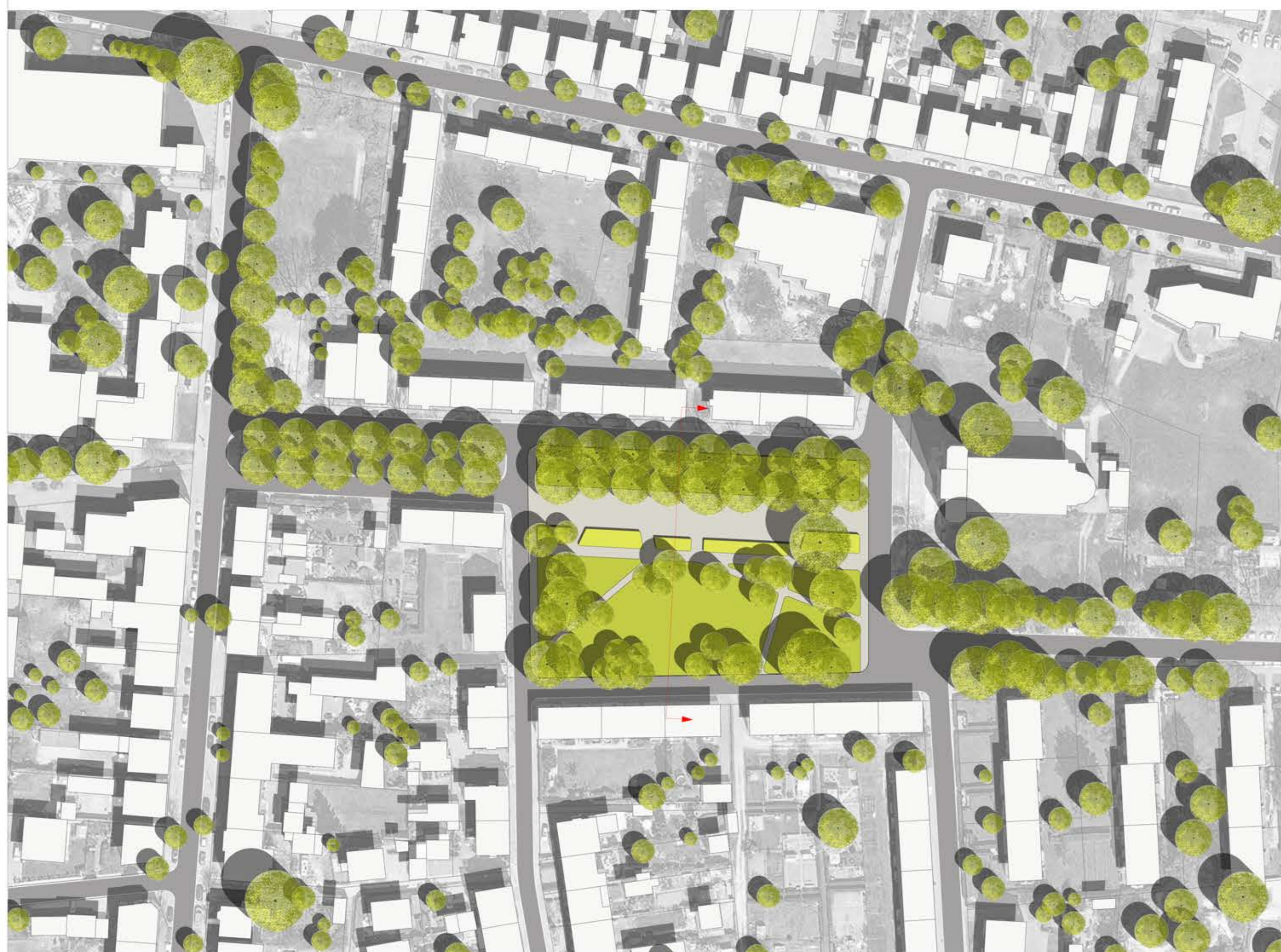
Lageplan 1 : 1000